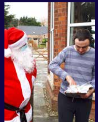
No-one missed out on seeing Santa Claus as ONE TEAM sprang into action, decking out a special 'Grotto-mobile' and driving the man himself around to all the homes to make his deliveries!