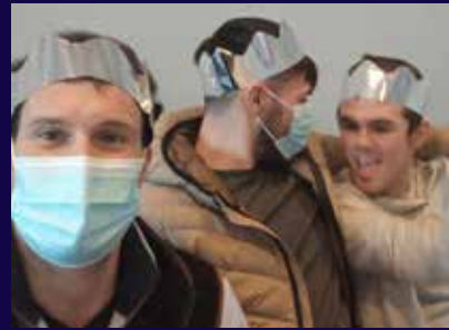
This year each home held their own 'Elf' party, with party games and festive food

Christmas is always a busy and fun-filled celebration, and at HFHC, the excitement didn't stop for COVID! From early December, activities were planned and delivered to all the homes, including kits to make food and decorations. This tied in with a daily 'Care2Christmas' advent calendar of YouTube programmes with songs, stories, dancing and quizzes as well as crafts and cooking. In place of the usual large HFHC Christmas Party, each home had an 'Elf' themed party delivered with festive party packs, games and delicious food for everyone to enjoy.